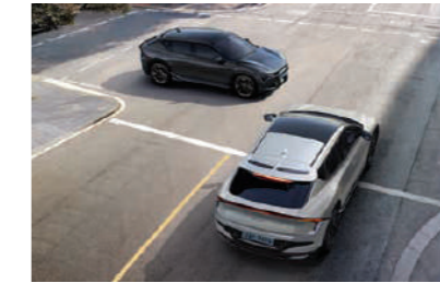
Forward Collision Avoidance Assist Alerts you and brakes when a vehicle or pedestrian appears suddenly.