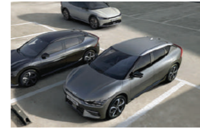
Rear Cross-Traffic Collision-Avoidance Assist (RCTA) Warns in case a vehicle or pedestrian is coming while reversing.