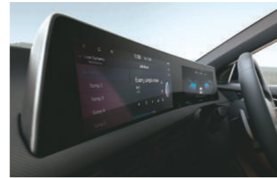
Dual 31.24cm (12.3") Panoramic Curved Display The integrated curved display, with maximum visibility and intuitiveness.