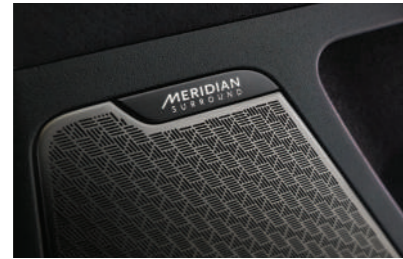
The Meridian Premium Sound System with 14 Speaker Pure Meridian sound. Immersive every time.