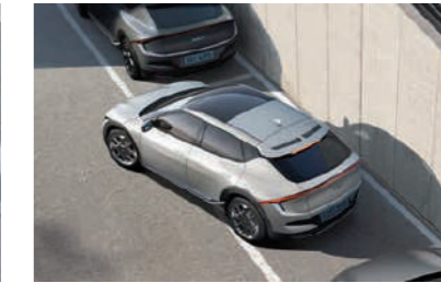
Safe Exit Assist Keeps doors locked when an unseen risk approaches.