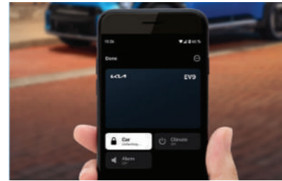
Digital Key 2.0 Seamless access, remote control, and smart sharing at your fingertips.