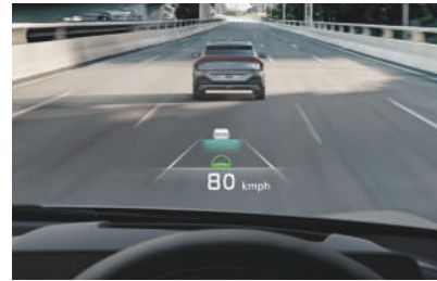
Augmented Reality Head-up Display Essential driving data displayed where you need it most.

Your EV6, your way. Kia Connect 2.0 brings seamless connectivity with smart navigation, real-time vehicle insights, and remote controls at your fingertips. Whether unlocking your car, adjusting settings, or planning your next route, technology moves with you.