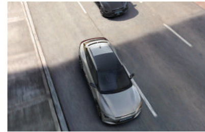
Blind-Spot Detection (BSD) Reduces the risk of collision with vehicles in the adjacent lane or coming from behind.

Designed for movement, engineered for safety. ADAS 2.0 ensures that every drive is backed by intelligent safety features, from lane departure warnings to smart collision avoidance, because true innovation doesn't just move, it protects.