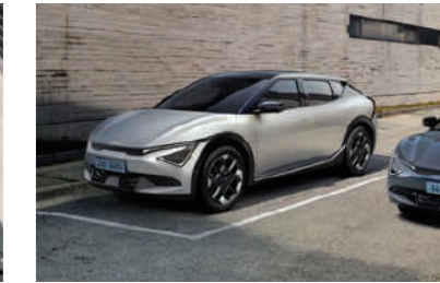
Forward/Side/Rear Parking Collision-Avoidance Assist Shields you from unexpected obstacles while parking.