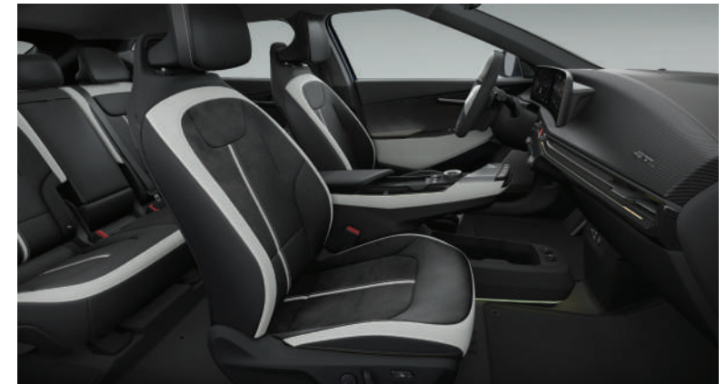
Saturn Black + Off white