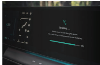
Over-the-Air (OTA) Software Updates From new features to optimized performance, OTA keeps your EV6 always up to date.