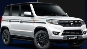
PEARL WHITE (DUAL TONE)