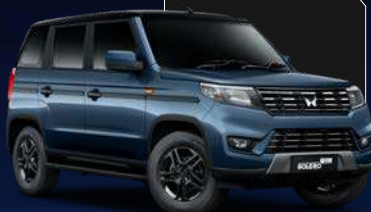
JEANS BLUE (DUAL TONE)